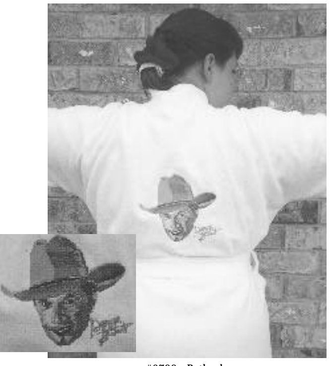
#6700 - Bathrobe