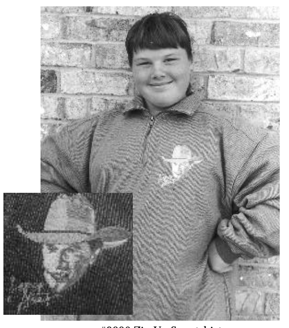
#9006 Zip Up Sweatshirt

FAN CLUB # - 1-615-824-7176 MONDAY - FRIDAY 9 A.M. - 5 P.M. ORDER DESK # - 1-800-338-4732 FAX # - 1-615-822-2527