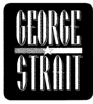
#530 - Koozie