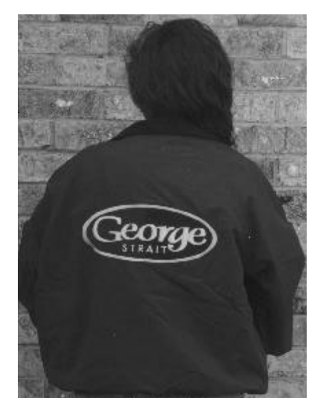
#9990 - Tour Jacket