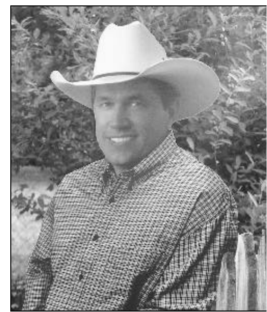
#245 - George Strait Stand Up (Close Up)