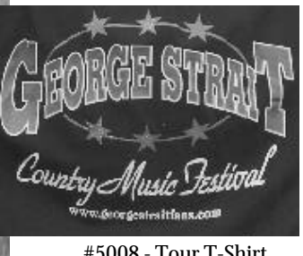
#5008 - Tour T-Shirt (Back)