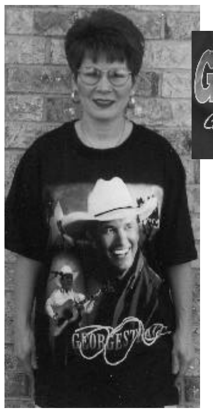
#5008 - Tour T-Shirt (Front)