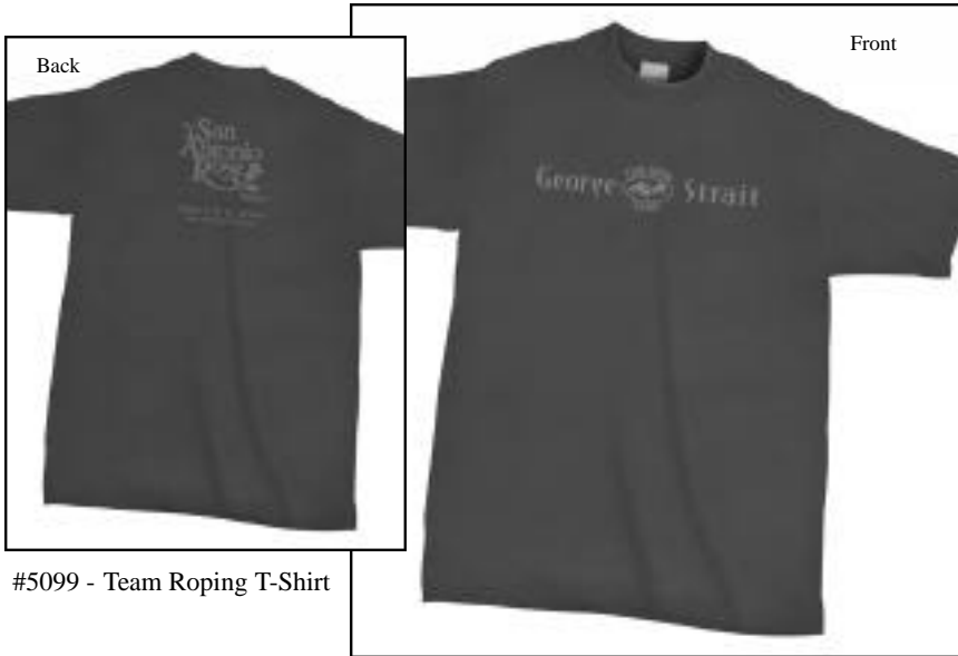
#5099 - Team Roping T-Shirt