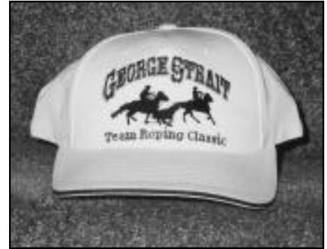
#4900 - Team Roping Cap Black or White