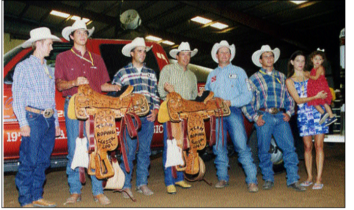
2nd Place Winners