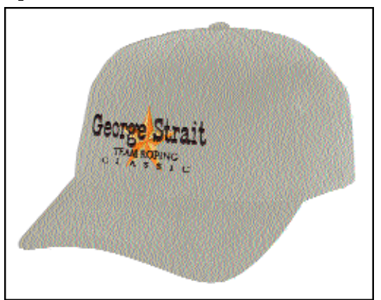
#4900 - Team Roping Cap