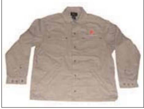
#9600 Natural Canvas Urban Coat