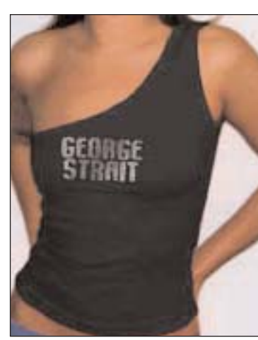
#4615 One Shoulder Top (Available in black or red)