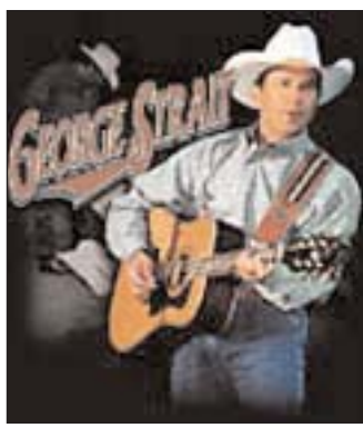
#5009 Black T-Shirt