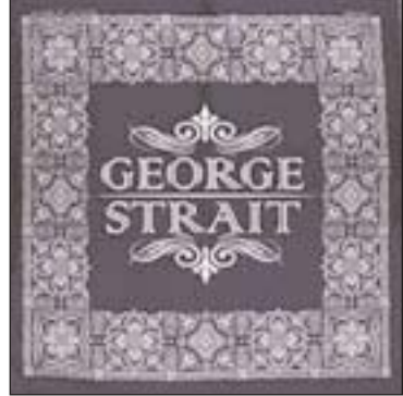
#4070 Navy Bandana