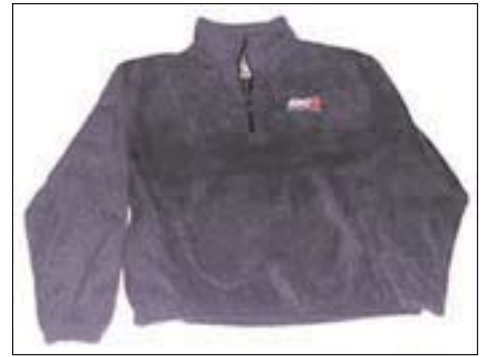
#9660 Navy Half Zip Polar Fleece Pull-Over