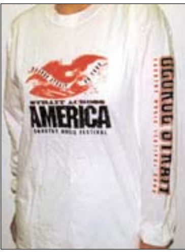
#5015 White Long Sleeve Shirt