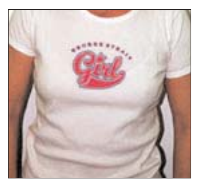
#4640 Ladies White Cap Sleeve