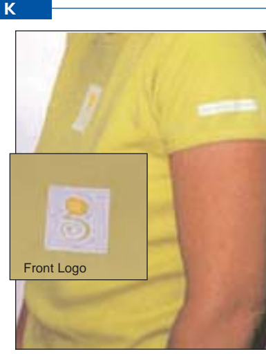
#4630 Kiwi Cap Sleeve