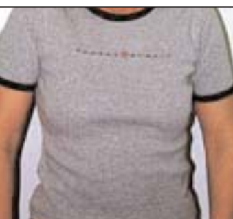
#4645 Ladies Ringer T-Shirt