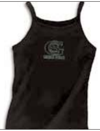
#4620 Ladies Black Spaghetti Tank Top