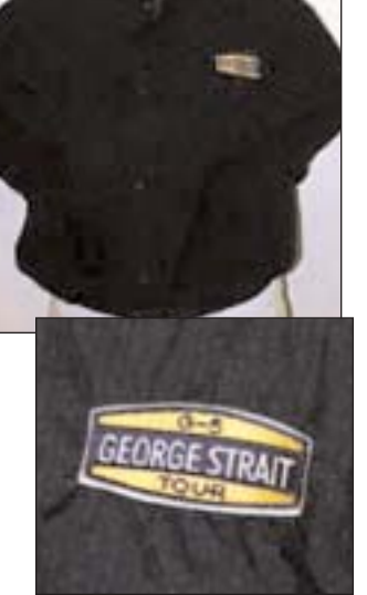
#9630 Navy/Nylon Warm Up Jacket