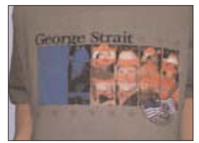
#5012 Prairie Dust T-Shirt