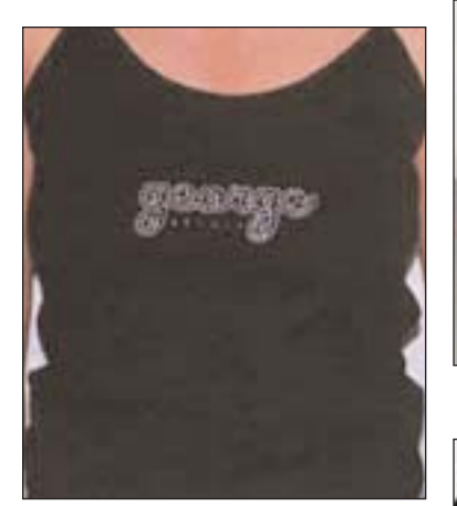
#4635 Black Spaghetti Tank