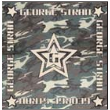
#4050 Camouflage Bandana