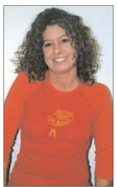
#4655 Red/Orange Ladies Baseball