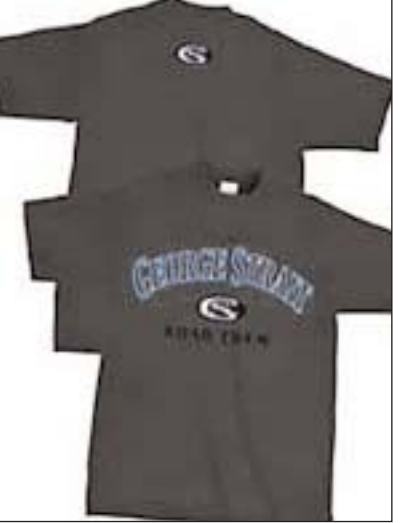
#5008 Road Crew T-Shirt