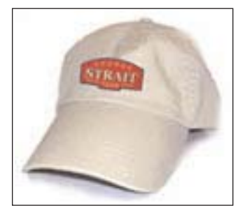
#4005 Embroidered Khaki Cap