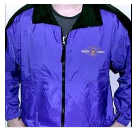
#9810 - Embroidered Windbreaker Jacket