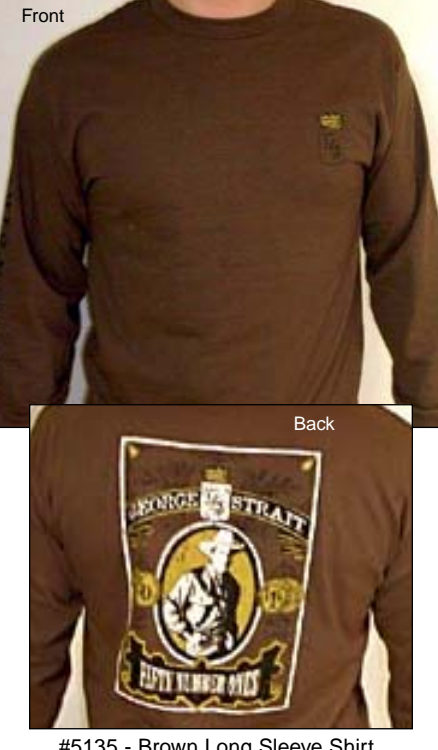
#5135 - Brown Long Sleeve Shirt