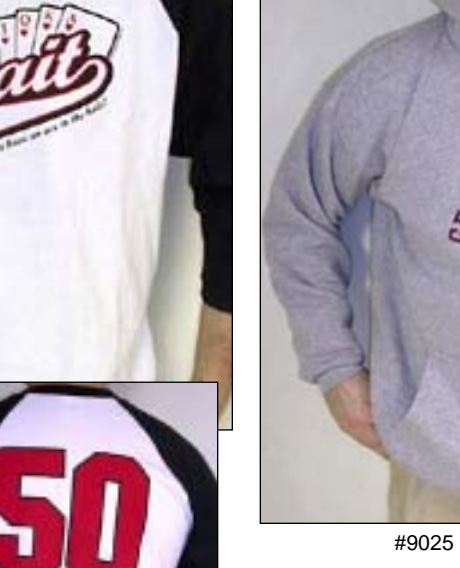
#9025 - Hooded Sweatshirt

HOURS: MON., WED., THURS. 8:30 A.M.-4:30 P.M. ► TUES. & FRI. 8:30 A.M.-3:00 P.M. (CENTRAL TIME) FAN CLUB #: 1-615-824-7176 > ORDER DESK #: 1-800-338-4732 > FAX #: 1-615-822-2527