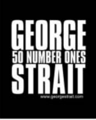
#520 - Koozie