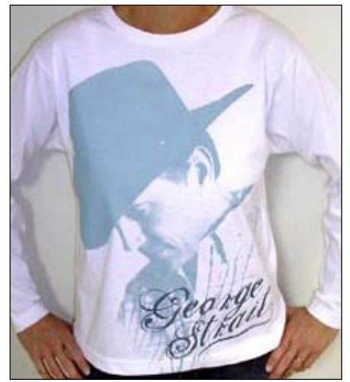
#4840 - White Ladies Long Sleeve Tee