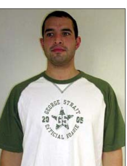
#5125 - White/Green Jersey T-Shirt