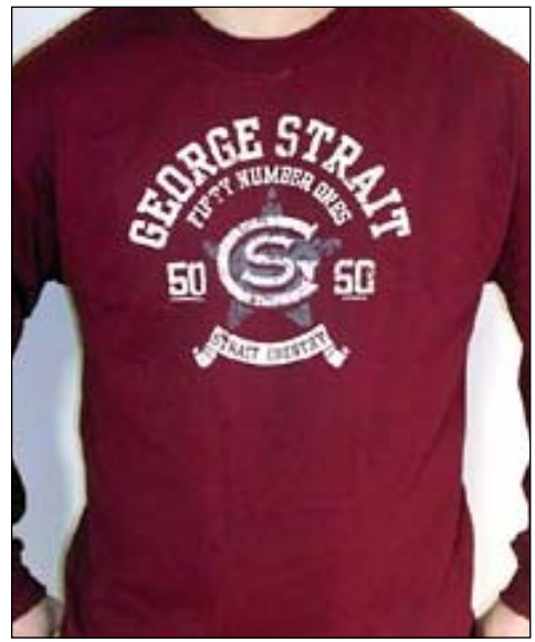
#5140 - Maroon Long Sleeve Shirt