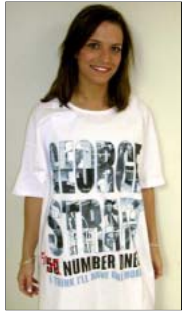
#6505 - Nightshirt