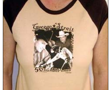
#4870 - Ladies Tan and Brown Tee