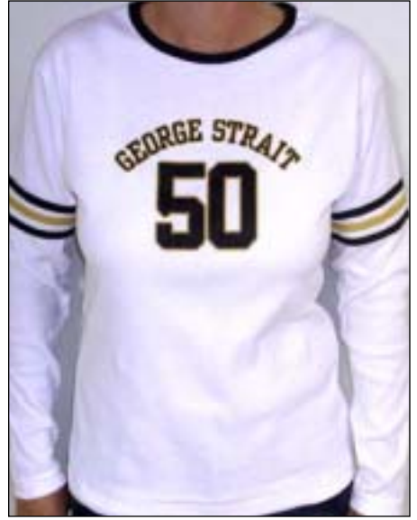
#4830 - White Ladies Long Sleeve