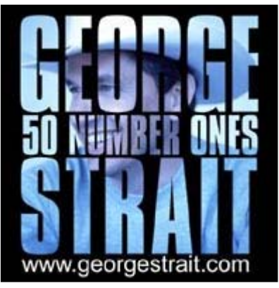
#545 - Photo Keychain and #216 - Photo Magnet