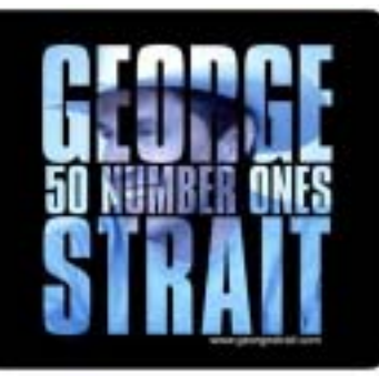
#304 - Photo Mouse Pad