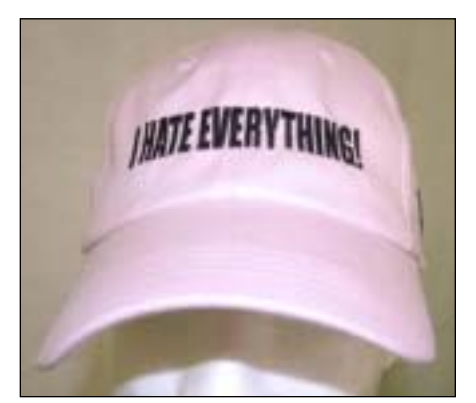
#4010 - Embroidered Ladies Cap