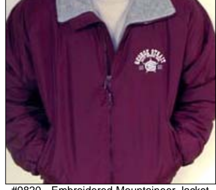
#9820 - Embroidered Mountaineer Jacket