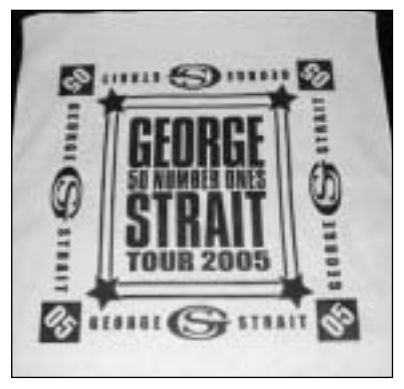
#3020 - Baby Blue Bandana