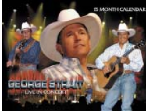
#625 - Calendar