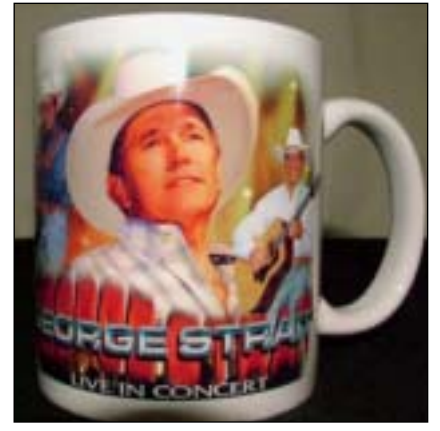
#1045 - Photo Coffee Mug