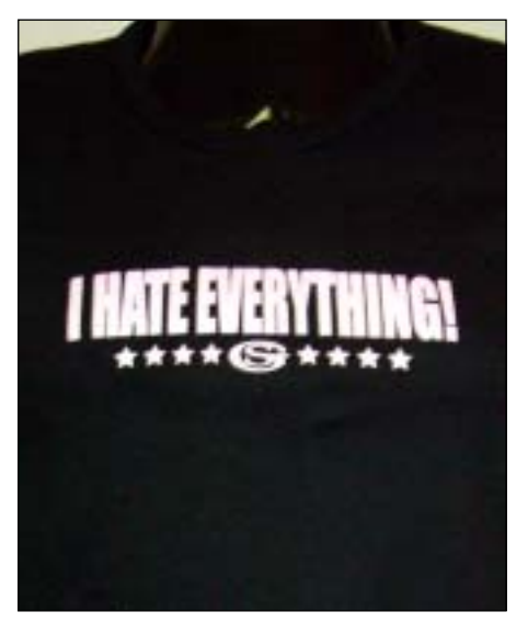
#4850 - Black Ladies Tee