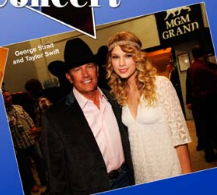
George Strait and Taylor Swift