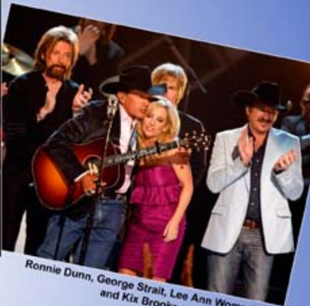
Ronnie Dunn, George Strait, Lee Ann Womack and Kix Brooks