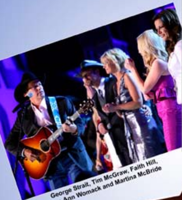
George Strait, Tim McGraw, Faith Hill, Lee Ann Womack and Martina McBride