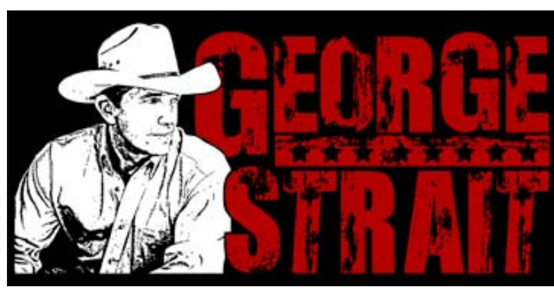
209 George Strait Bumper Sticker