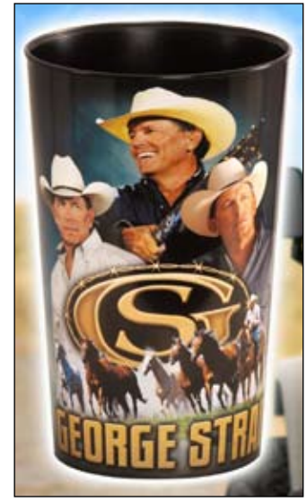
1053 Stadium Cup