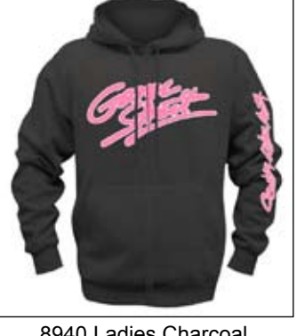
8940 Ladies Charcoal Zip-Up Hooded Sweatshirt