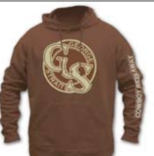
8945 Saddle Brown Hoodie

4395 Black Long Sleeve Distressed Flag T-Shirt