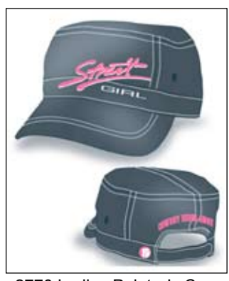
2770 Ladies Painter's Cap