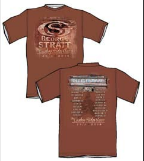
4360 Truck T-Shirt