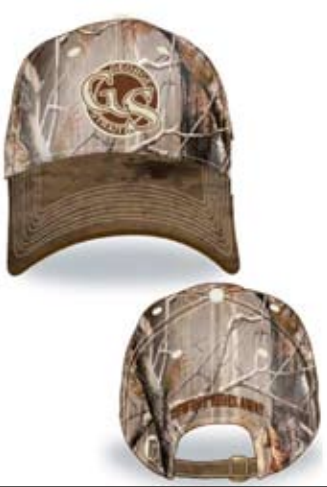
2750 Brown Camouflage Cap