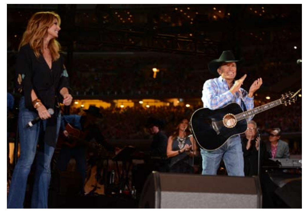
George Strait with Faith Hill

For this show, Strait used a different stage configuration that allowed for the extra seats: a custom revolving stage set center field (he's only used it twice before, in Houston and San Antonio). It was the best concert set-up I've