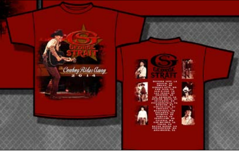
4430 - Cardinal TOUR T-Shirt