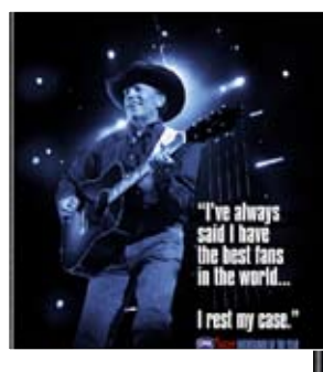
4455 - Entertainer of the Year T-Shirt