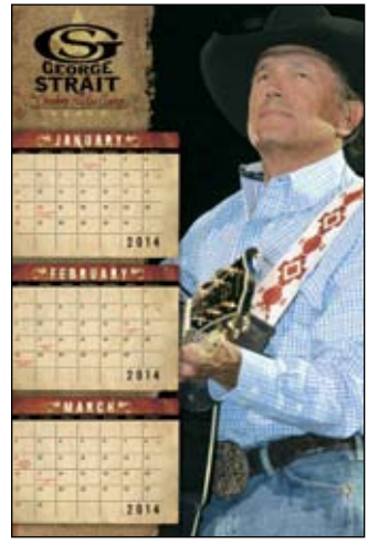
642 - Calendar (January 2014-March 2015)