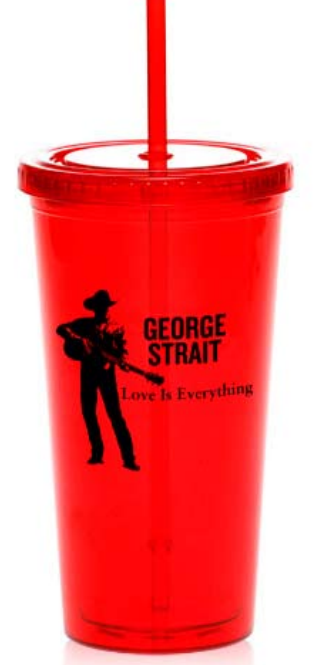
1030 - Tumber (Double Wall Acrylic)