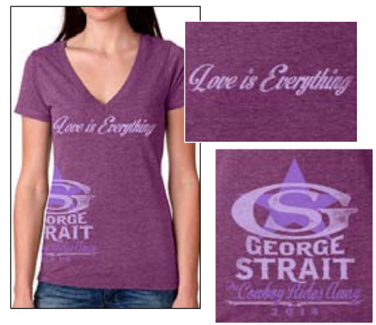
4412 - Ladies PLUM V-Neck Tee