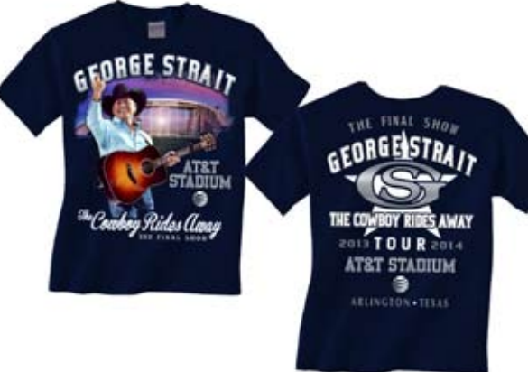
4460 - George Strait Final Show Event T-Shirt