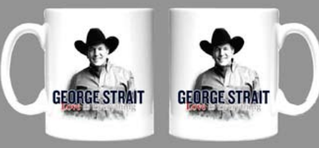
1145 - White Photo Coffee Mug