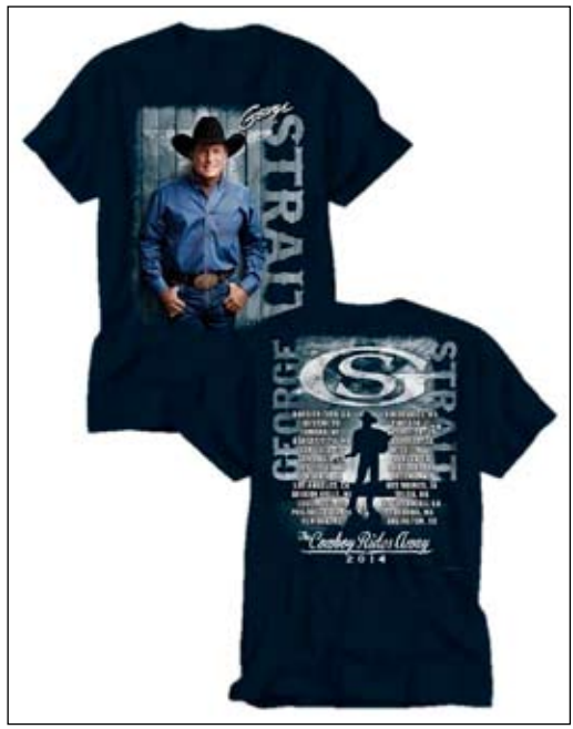
4440 - Navy Blue TOUR T-Shirt