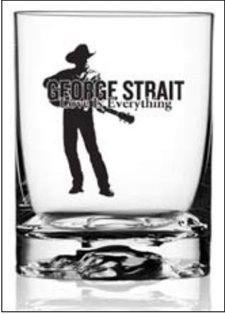
1019 - Old Fashioned Glass