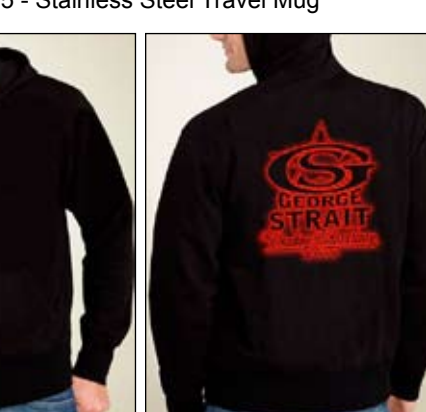
8950 - Black RED GLOW Zip-Up Hooded Sweatshirt