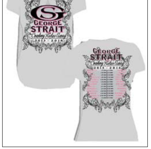
4415 - Ladies CHARCOAL Tour Tee