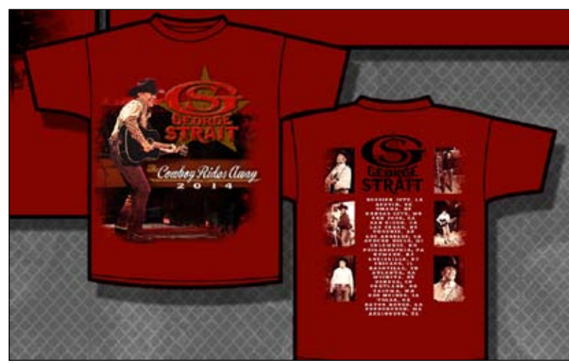
4430 - Cardinal TOUR T-Shirt