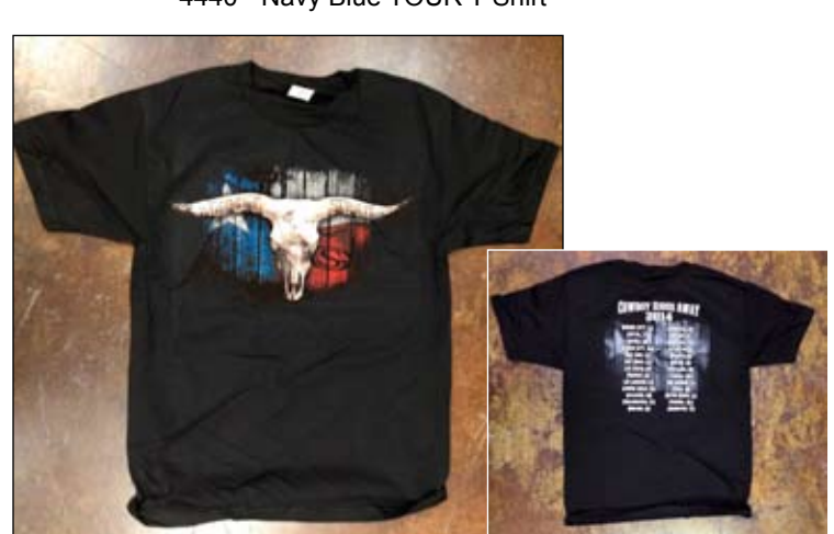
4450 - Black TEXAS LONGHORN T-Shirt