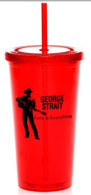
1030 - Tumber (Double Wall Acrylic)