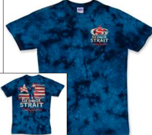
4425 - Blue TIE-DYE T-Shirt