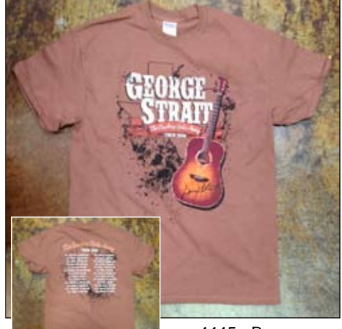
4445 - Brown GUITAR T-Shirt