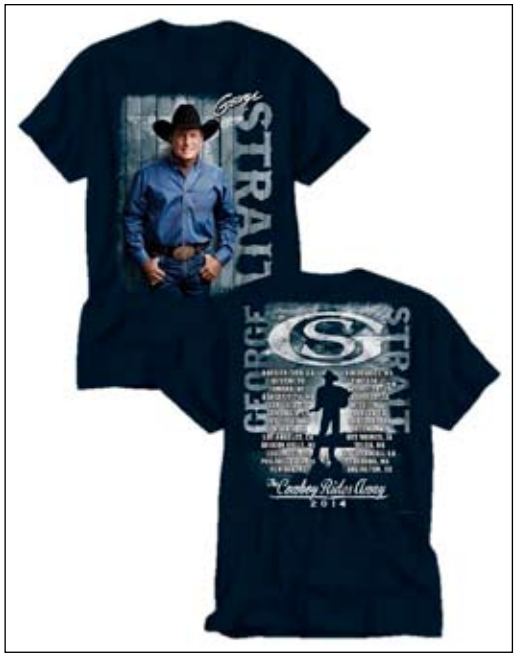
4440 - Navy Blue TOUR T-Shirt