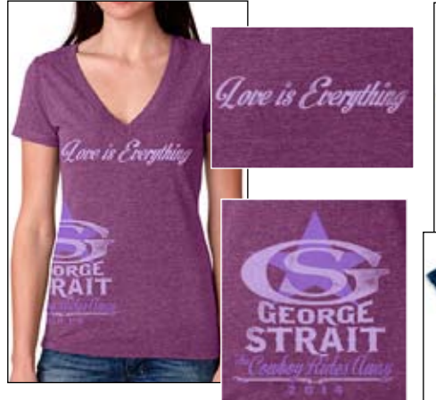
4412 - Ladies PLUM V-Neck Tee