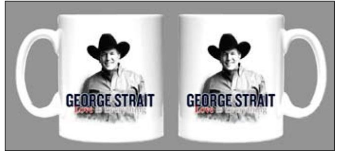
1145 - White Photo Coffee Mug